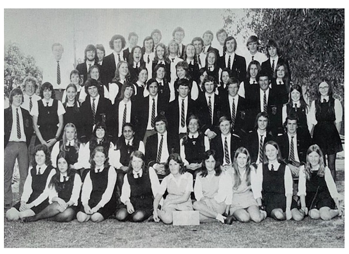
Year 12, 1972 If you are in this photo, we would love to see you at the August lunch