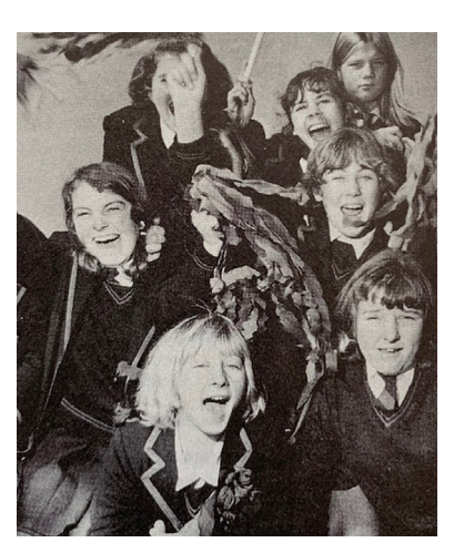
A group of enthusiastic Astley Cup supporters from the 1969 Bindyite