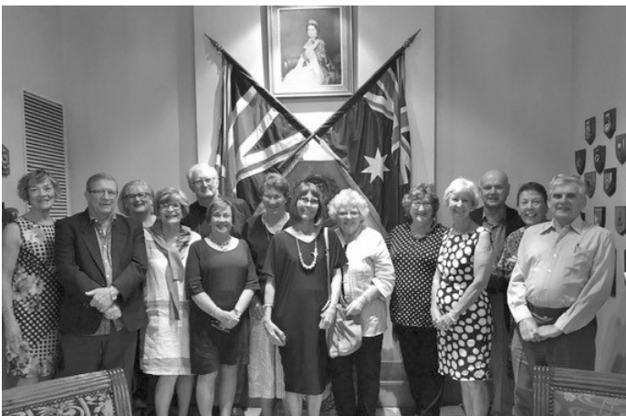
The largest year group at the 2019 lunch was the Class of 1965