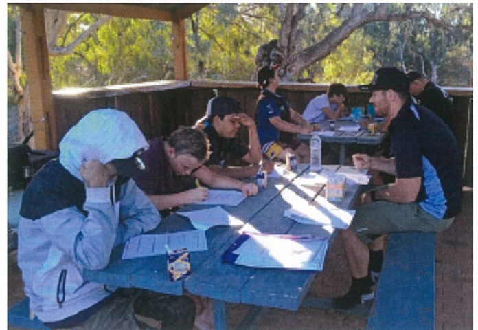
↑ Yarning circle—Discussion ↓ Training mornings started

This fortnight our Academy has had a steady flow of activities and time on the ground in classrooms with the Clontarf members. Students are getting back into routine after a good break. We have also welcomed a few new faces to the Clontarf family this term which is great to see. Our leaders of each year group have shown the new members what is expected of them from the Clontarf & school staff. A big focus for the start of this term is supporting our Year 7 & 9 members as they work towards achieving some positive results in their NAPLAN tests. We are proud of the members who have been staying back after school to do some extra preparation for NAPLAN. All members are now back at school. Work hard gents and the rewards will come.