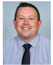
Year 12 Deputy Principal